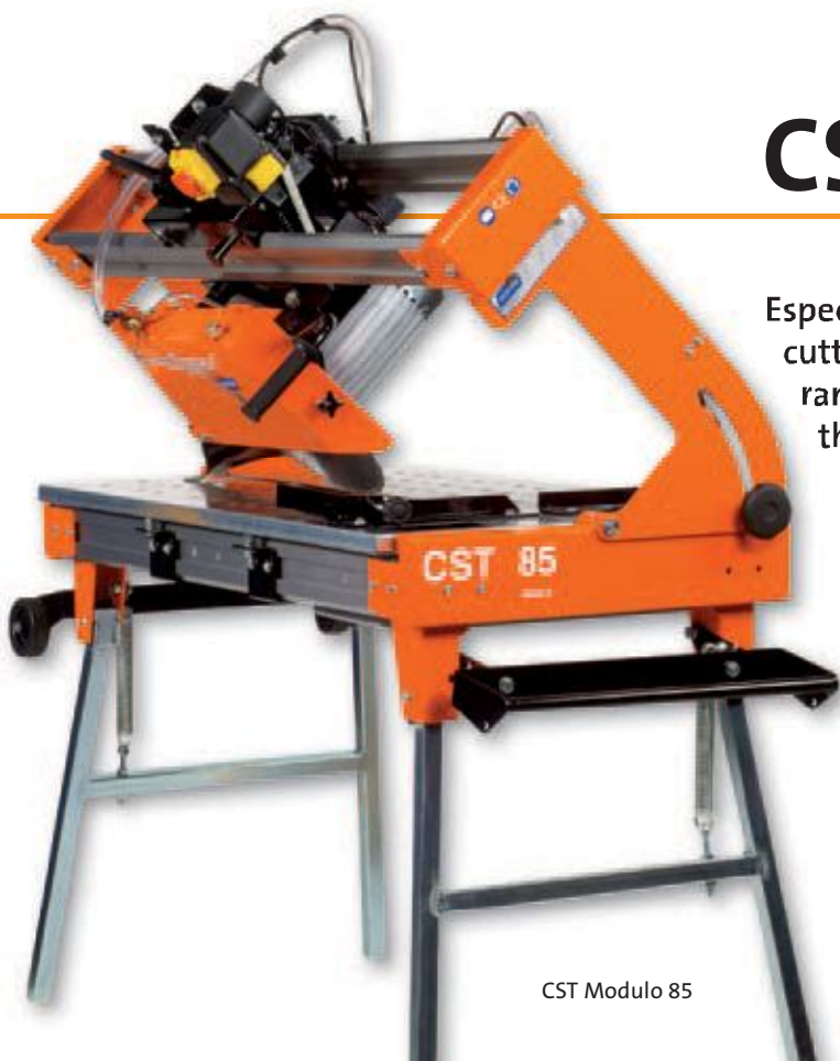
CST Modulo 85