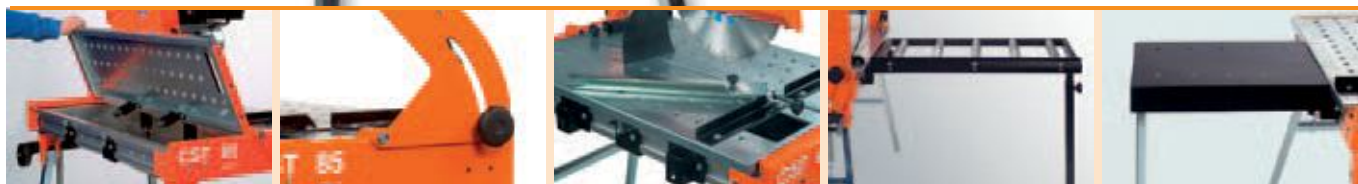
Easy to open table in two parts

Machines delivered without diamond blade.