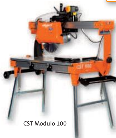
CST Modulo 100

Machines delivered without diamond blade.